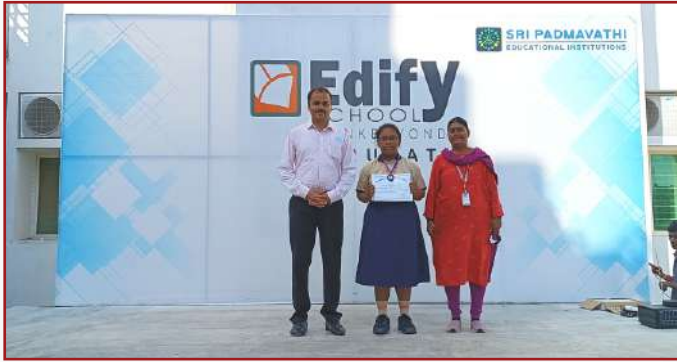
The proud 1st batch of NCC cadets of our school received their 'A' certificate from 29(A)Bn Tirupati