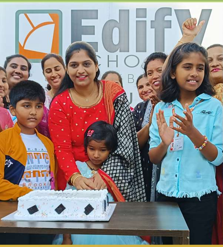
New Year Celebrations Primary