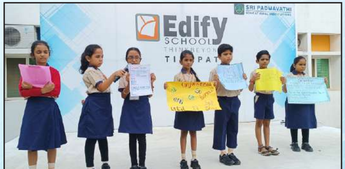
Types of Conjunctions