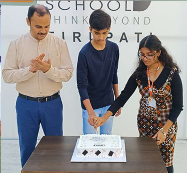
New Year Celebrations Secondary