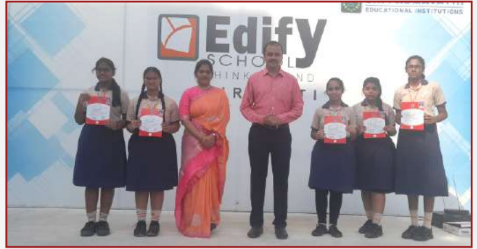
Uniform for them is a matter of pride, and medals on them is their pride...