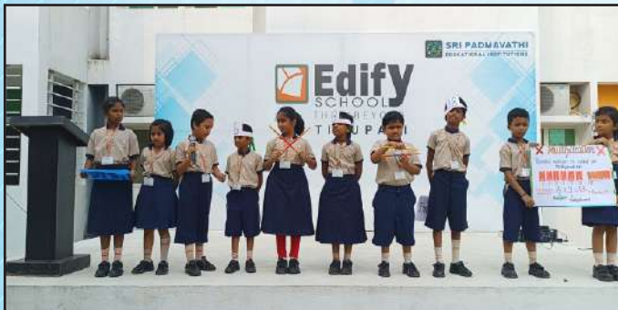
Multiplication and its properties

Concept of Basic Multiplication- PIC MISSING