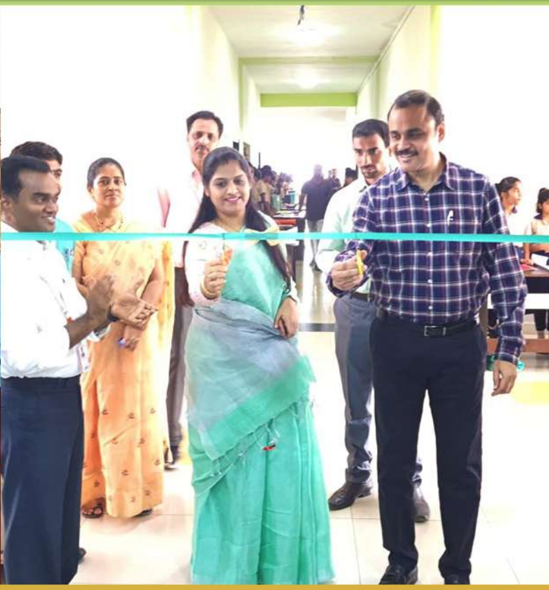
Mathematics exhibition National Mathematics Day