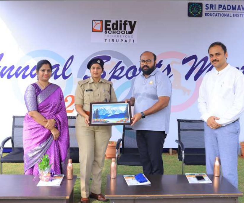
Decennial Year Annual Sports Day