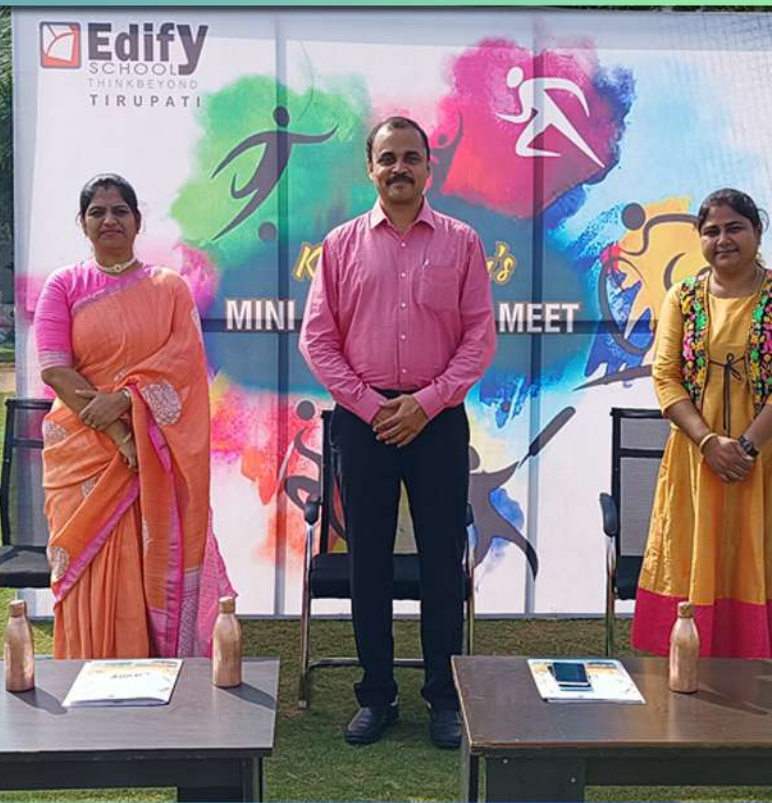
Mini Edi Sports Day